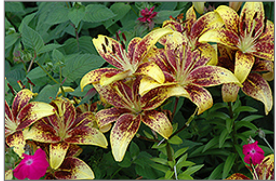
Honey Bee Lily flowers