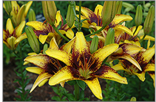
Tiger Play Lily flowers