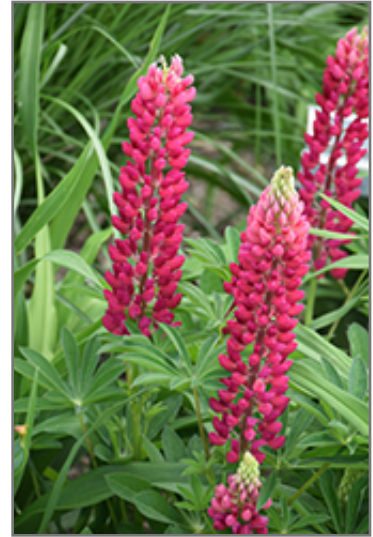
Popsicle Red Lupine flowers