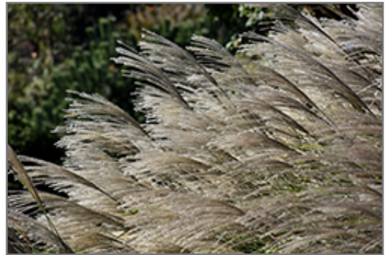
Gracillimus Maiden Grass fruit