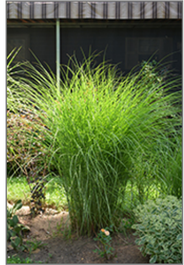
Gracillimus Maiden Grass

* This is a 'special order' plant - contact store for details