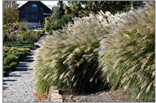
Gracillimus Maiden Grass

Gracillimus Maiden Grass is recommended for the following landscape applications;