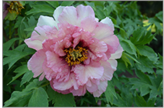
Anna Marie Tree Peony flowers

A beautiful woody peony for the garden collector, with delicate flowers in a soft shell pink with deep crimson eyes and yellow stamens; great as an accent in the garden; unlike perennial peonies, remember not to prune this variety