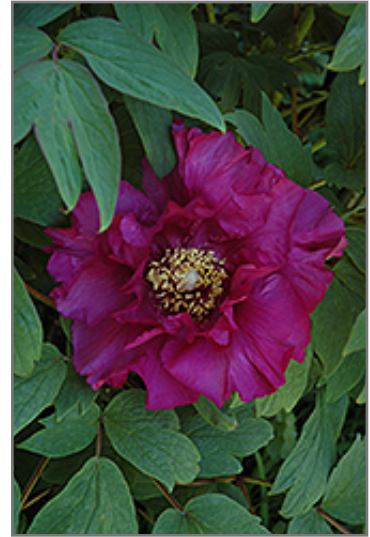
Shiko Tree Peony flowers

Shiko Tree Peony will grow to be about 5 feet tall at maturity, with a spread of 5 feet. It has a low canopy, and is suitable for planting under power lines. It grows at a slow rate, and under ideal conditions can be expected to live for approximately 20 years.