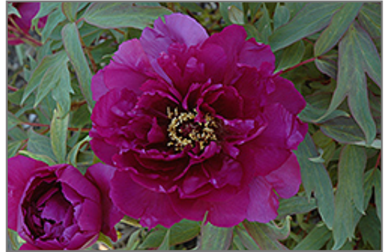
Vesuvian Tree Peony flowers

Vesuvian Tree Peony will grow to be about 5 feet tall at maturity, with a spread of 5 feet. It has a low canopy, and is suitable for planting under power lines. It grows at a slow rate, and under ideal conditions can be expected to live for approximately 20 years.