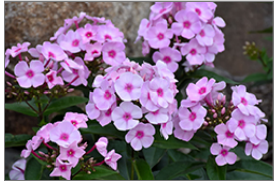
Cotton Candy Garden Phlox flowers