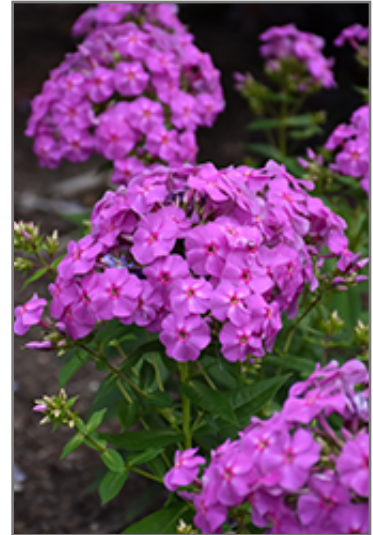
Flame Lilac Garden Phlox flowers

Flame Lilac Garden Phlox is recommended for the following landscape applications;