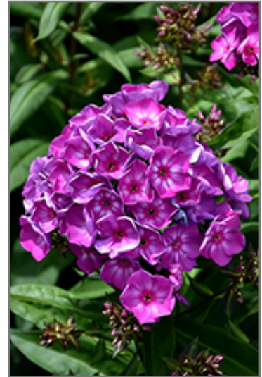
Grape Lollipop Garden Phlox flowers

Grape Lollipop Garden Phlox is recommended for the following landscape applications;