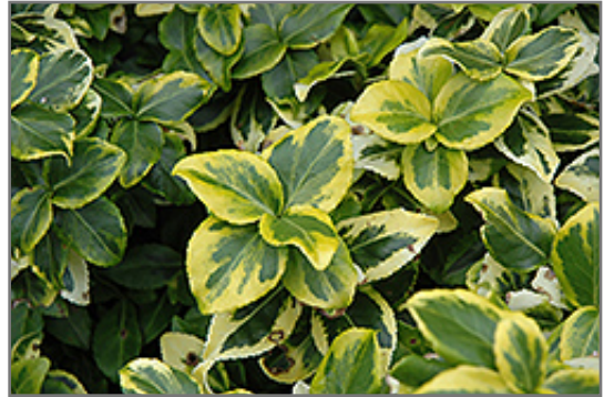
Gold Prince Wintercreeper foliage