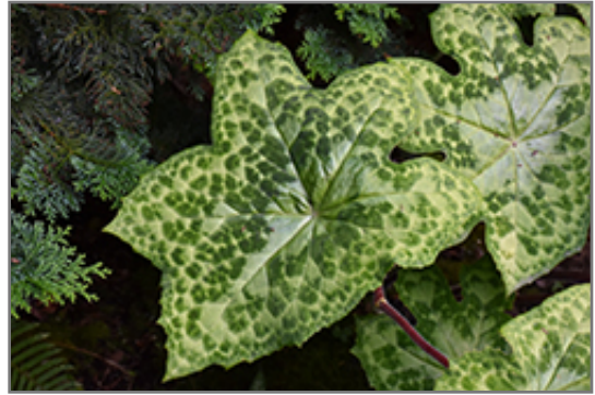
Spotty Dotty Asian Mayapple foliage