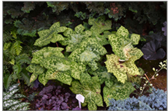
Spotty Dotty Asian Mayapple