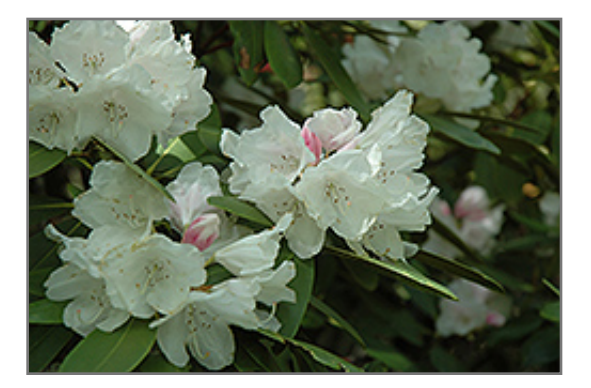
Anna H. Hall Rhododendron flowers