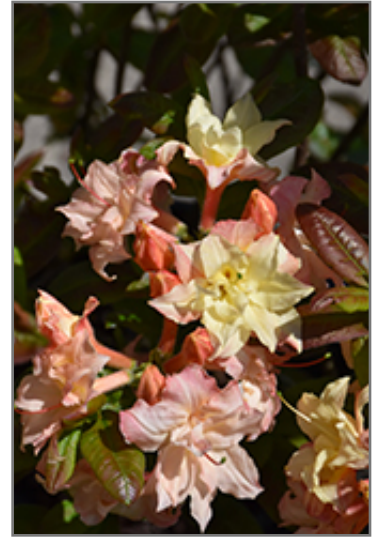
Cannon's Double Azalea flowers