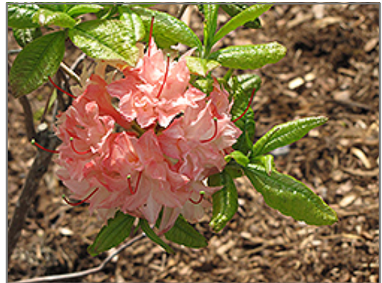
Cannon's Double Azalea flowers