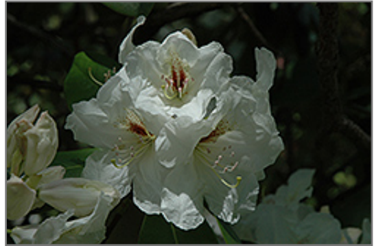
Edmond Amateis Rhododendron flowers

An elegant cultivar with large white blooms with a contrasting dark red blotch that adds tremendous visual impact; eye catching as a garden accent; absolutely must have well-drained, highly acidic and organic soil, use plenty of peat moss when planting