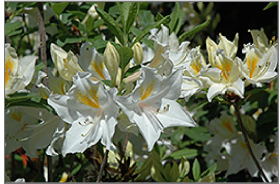
Exbury White Azalea flowers

One of the family of Exbury Hybrids, this variety features dense clusters of snow white blooms, each with an amazing yellow blotch, blooming in mid to late spring; a compact rounded shrub; needs highly acidic and organic soil that is well drained