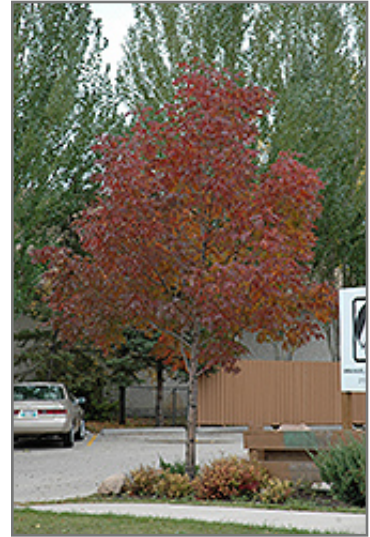
Northern Blaze White Ash in fall