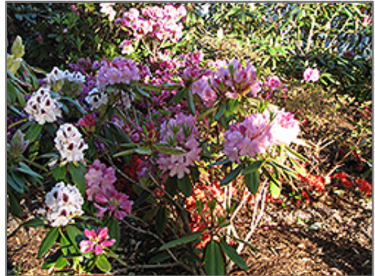
Kullervo Rhododendron in bloom