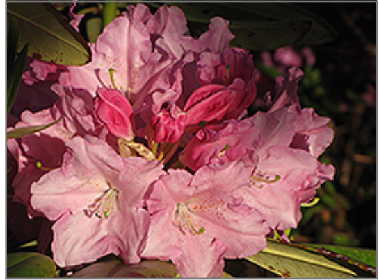
Kullervo Rhododendron flowers