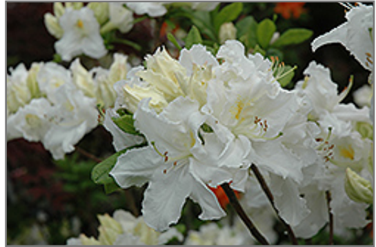
Oxydol Azalea flowers

Stunning clusters of frilly white blooms with yellow blotches cover this hardy azalea in mid to late spring; an upright and airy shrub that would be wonderful in borders or as an accent shrub; needs highly acidic and organic soil that is well drained