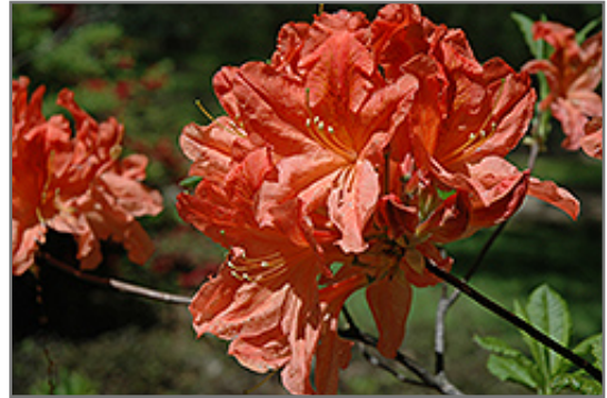
Peach Sunset Azalea flowers

Stunning Peach blooms with a pronounced orange blotch adorn this vigorous and hardy variety in mid spring; it will definitely make an impact along borders or as an accent; absolutely must have well-drained, highly acidic and organic soil