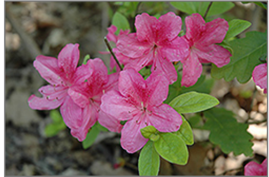
Pink Gem Azalea flowers