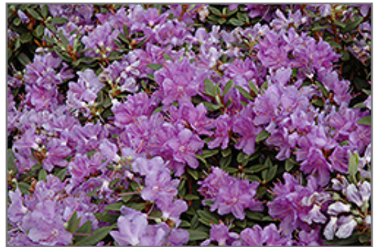
Purple Gem Rhododendron flowers