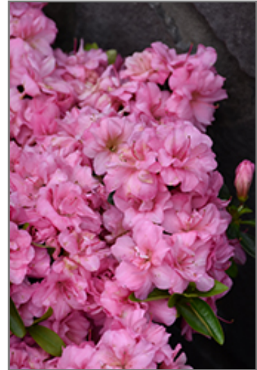
Rosebud Azalea flowers