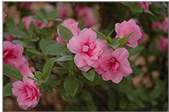
Rosebud Azalea flowers