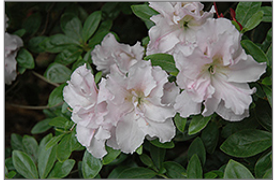
Susan Camille Azalea flowers

Clusters of blooms that are a very light shell pink with pink blotches, cover this azalea in mid spring; a compact upright shrub that is great along borders; needs highly acidic and organic soil that is well drained