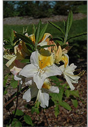
Toucan Azalea flowers

Toucan Azalea will grow to be about 6 feet tall at maturity, with a spread of 8 feet. It tends to be a little leggy, with a typical clearance of 1 foot from the ground, and is suitable for planting under power lines. It grows at a slow rate, and under ideal conditions can be expected to live for 40 years or more.