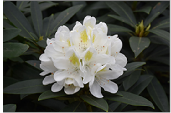
Chionoides Rhododendron flowers

Chionoides Rhododendron will grow to be about 6 feet tall at maturity, with a spread of 6 feet. It tends to be a little leggy, with a typical clearance of 1 foot from the ground, and is suitable for planting under power lines. It grows at a slow rate, and under ideal conditions can be expected to live for 40 years or more.