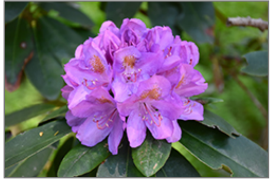
Grandiflorum Rhododendron flowers