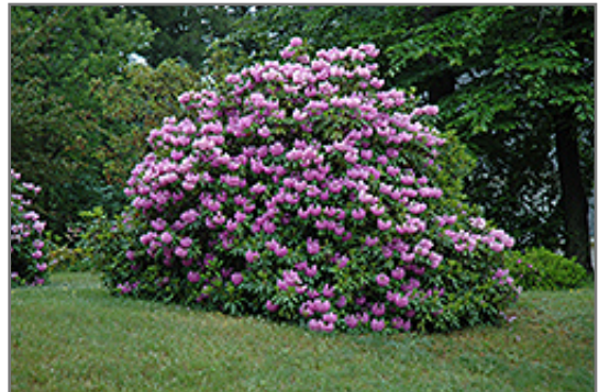
Grandiflorum Rhododendron in bloom