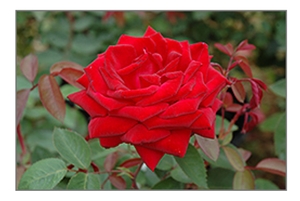
Kashmir Rose flowers

Kashmir Rose is recommended for the following landscape applications;