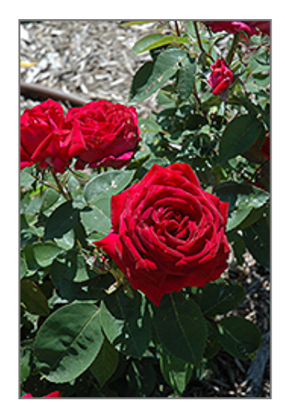
Kashmir Rose flowers

361 N. Hunter Highway Drums, PA 18222 (570) 788-4181 www.beechwood-gardens.com