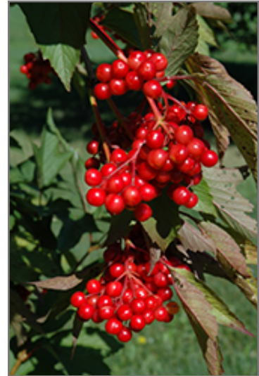
Hahs American Cranberry fruit

This is a relatively low maintenance shrub, and should only be pruned after flowering to avoid removing any of the current season's flowers. It is a good choice for attracting birds to your yard, but is not particularly attractive to deer who tend to leave it alone in favor of tastier treats. It has no significant negative characteristics.