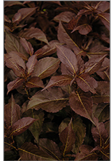
Shining Sensation Weigela foliage

This shrub should only be grown in full sunlight. It prefers to grow in average to moist conditions, and shouldn't be allowed to dry out. It is not particular as to soil type or pH. It is highly tolerant of urban pollution and will even thrive in inner city environments. This is a selected variety of a species not originally from North America.