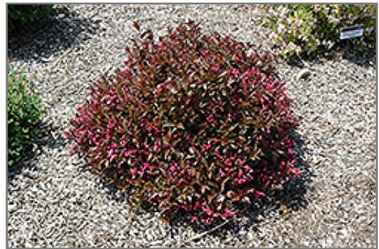
Shining Sensation Weigela in bloom