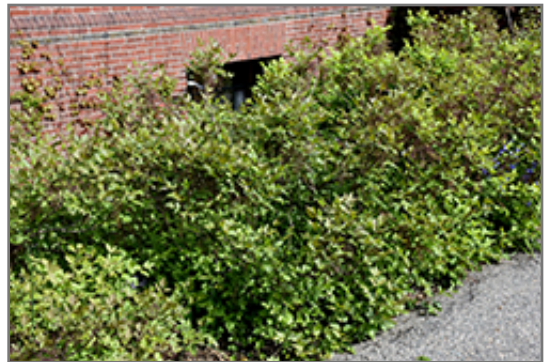
Shrub Yellowroot