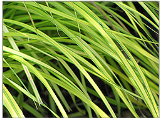
Bowles' Golden Sedge foliage