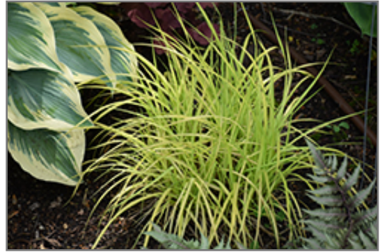
Bowles' Golden Sedge

Bowles' Golden Sedge is recommended for the following landscape applications;