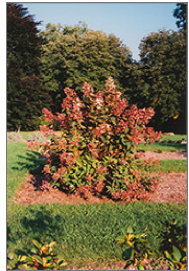
Tardiva Hydrangea in bloom