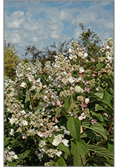
Tardiva Hydrangea flowers

* This is a 'special order' plant - contact store for details