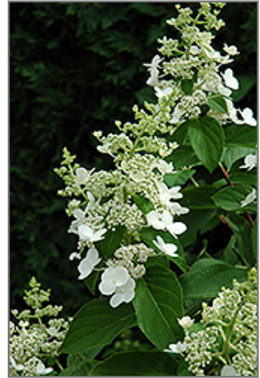
Tardiva Hydrangea flowers