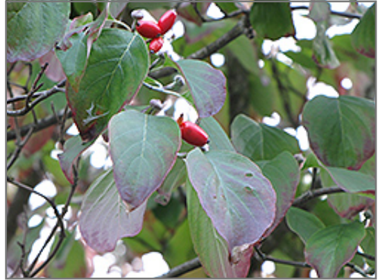
Cherokee Chief Flowering Dogwood fruit

This tree does best in full sun to partial shade. You may want to keep it away from hot, dry locations that receive direct afternoon sun or which get reflected sunlight, such as against the south side of a white wall. It requires an evenly moist well-drained soil for optimal growth, but will die in standing water. It is very fussy about its soil conditions and must have rich, acidic soils to ensure success, and is subject to chlorosis (yellowing) of the foliage in alkaline soils. It is quite intolerant of urban pollution, therefore inner city or urban streetside plantings are best avoided, and will benefit from being planted in a relatively sheltered location. Consider applying a thick mulch around the root zone in winter to protect it in exposed locations or colder microclimates. This is a selection of a native North American species.