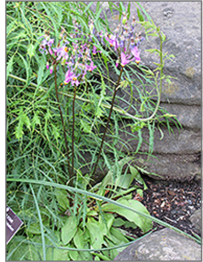
Red Wings Shooting Star flowers