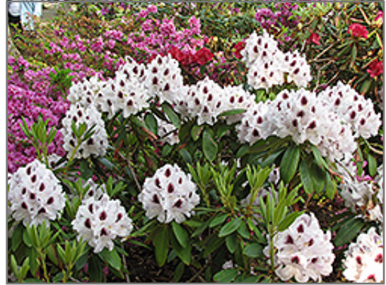
Sapporo Rhododendron flowers

This dazzling evergreen shrub is bathed in clusters of snowy white blooms with a dramatic deep purple blotch; an excellent choice to mass in groupings, or as an elegant focal point of the garden; must have rich acidic soil