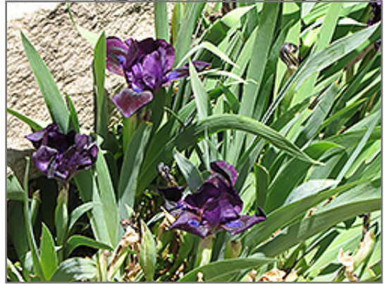
Bee Mused Iris flowers