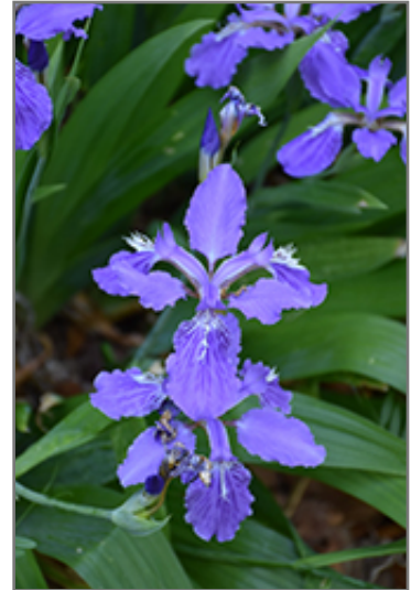
Rooftop Iris flowers