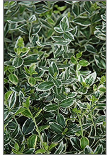
White Gaiety Wintercreeper foliage