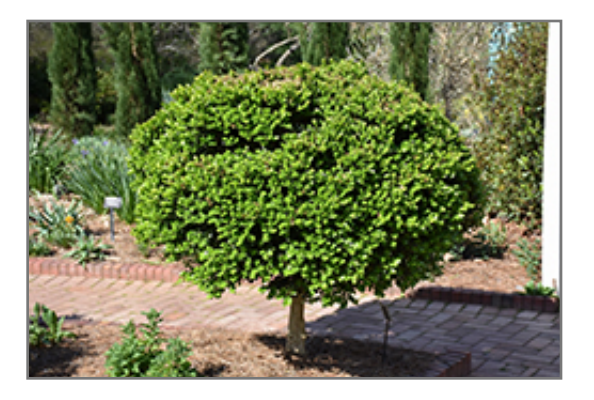
Common Boxwood (tree form)

361 N. Hunter Highway Drums, PA 18222 (570) 788-4181 www.beechwood-gardens.com