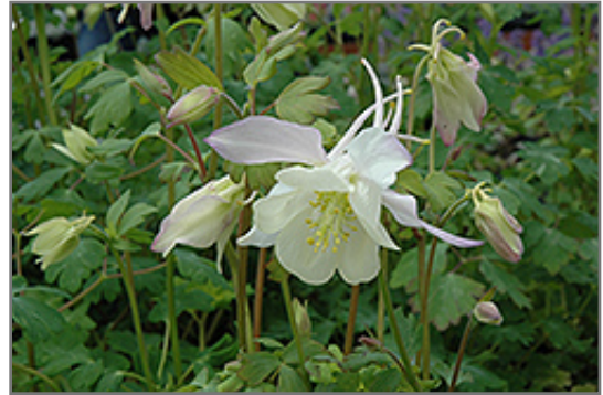
Music Pure White Columbine flowers