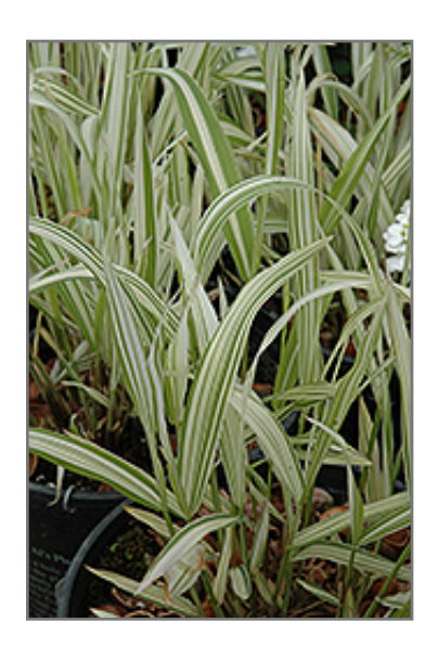
River Mist Northern Sea Oats foliage