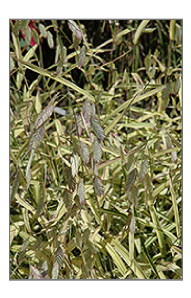
River Mist Northern Sea Oats fruit