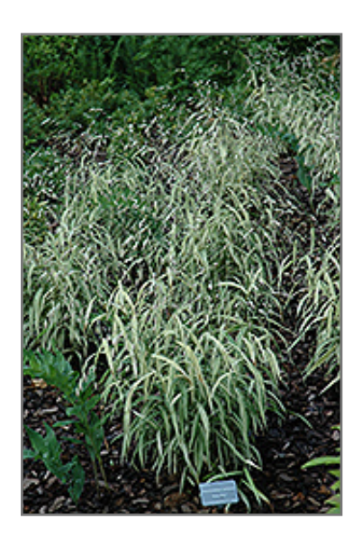
River Mist Northern Sea Oats