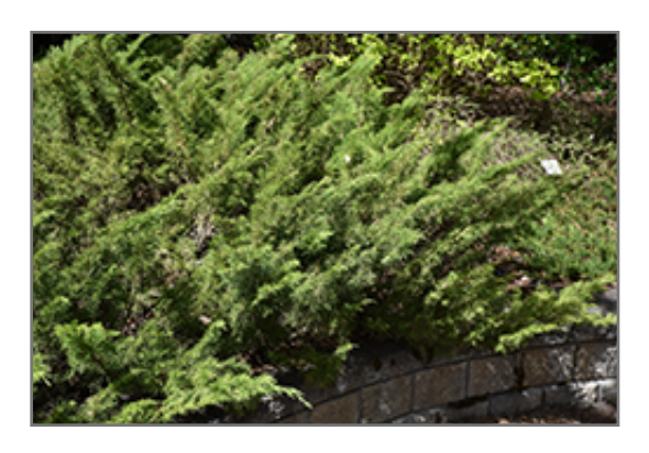
Skandia Juniper

Skandia Juniper is recommended for the following landscape applications;