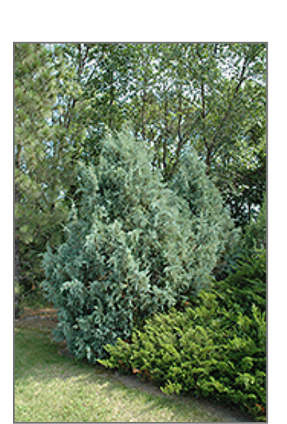
Wichita Blue Juniper