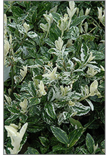
Harlequin Wintercreeper foliage

Harlequin Wintercreeper will grow to be about 12 inches tall at maturity, with a spread of 24 inches. It tends to fill out right to the ground and therefore doesn't necessarily require facer plants in front. It grows at a slow rate, and under ideal conditions can be expected to live for approximately 30 years.