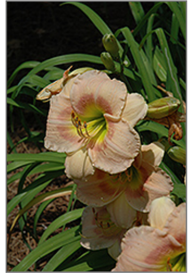
Bacon Michelle Yant Daylily flowers