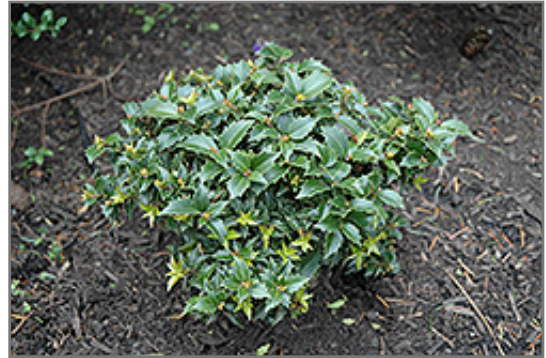
Rock Garden Holly