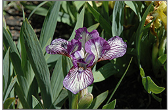
Flea Circus Iris flowers