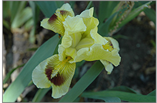
Ritz Iris flowers

Ritz Iris features showy lightly-scented yellow flag-like flowers with burgundy overtones and a yellow beard at the ends of the stems in early spring. The flowers are excellent for cutting. Its attractive sword-like leaves remain bluish-green in color throughout the season.