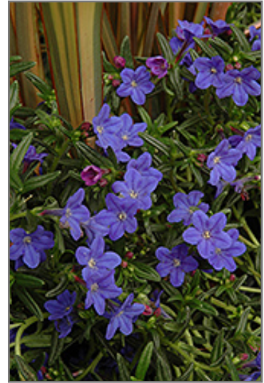
Grace Ward Lithodora in bloom