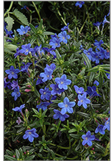
Grace Ward Lithodora flowers